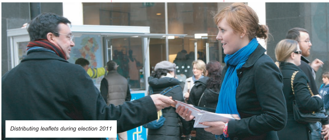
Distributing leaflets during election 2011

It is quite incredible that The Irish Times and others allowed abortion campaigners to put a false spin on the facts, particularly when those facts were readily available. The Irish media are guilty of either wilful misrepresentation or of sloppy, lazy journalism in regard to their reporting of the custom seizures. The Life Institute has written to the editors and journalists in question in each case. We'll be following developments closely. ●