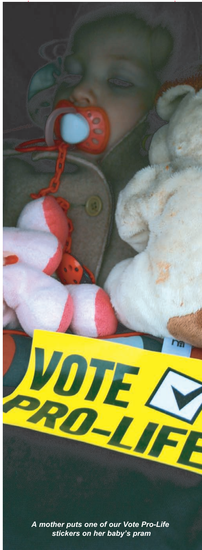
A mother puts one of our Vote Pro-Life stickers on her baby's pram

However, the hard work put in by pro-life activists before the election produced results. Significant numbers of voters learned about Labour's desire