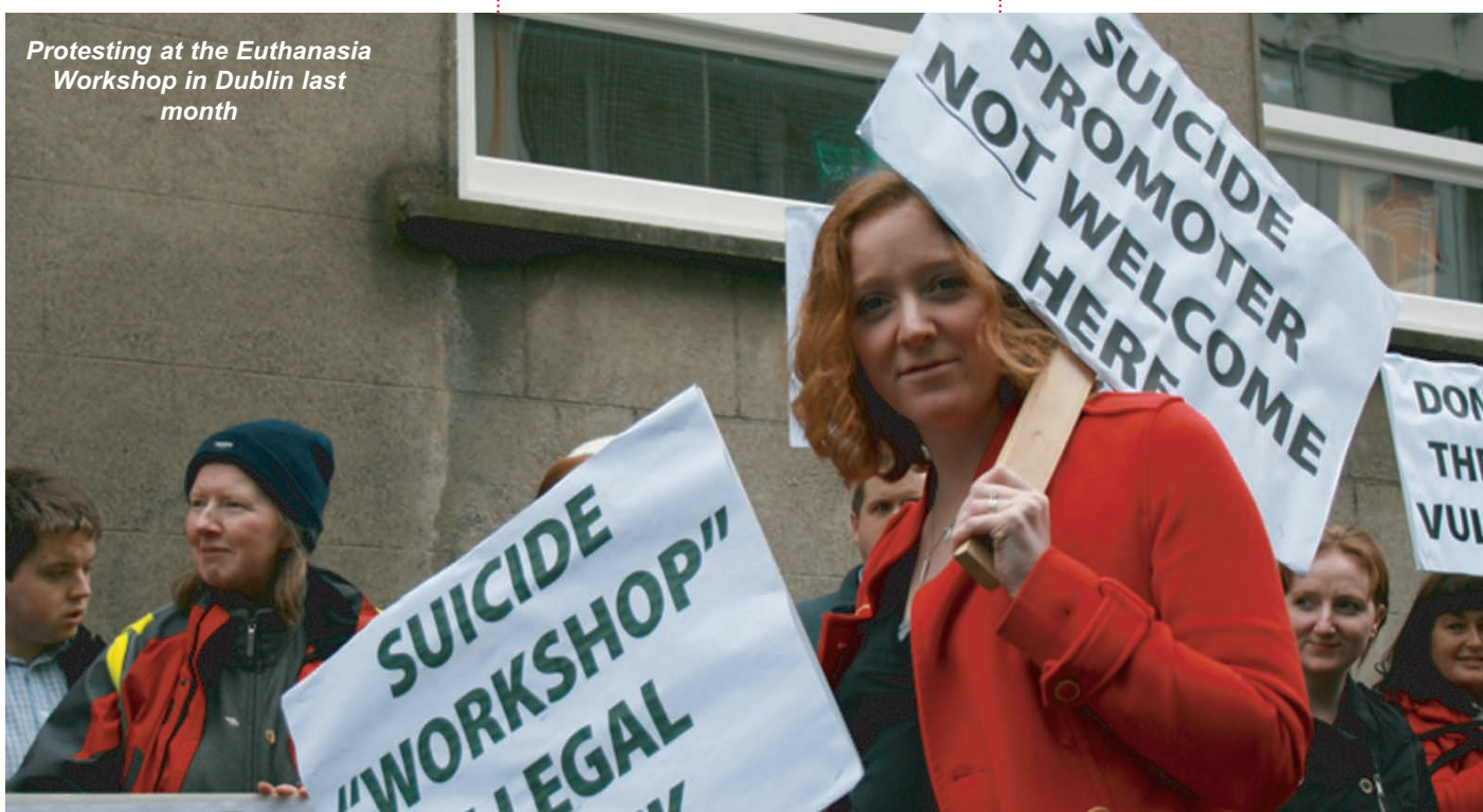
Protesting at the Euthanasia Workshop in Dublin last month