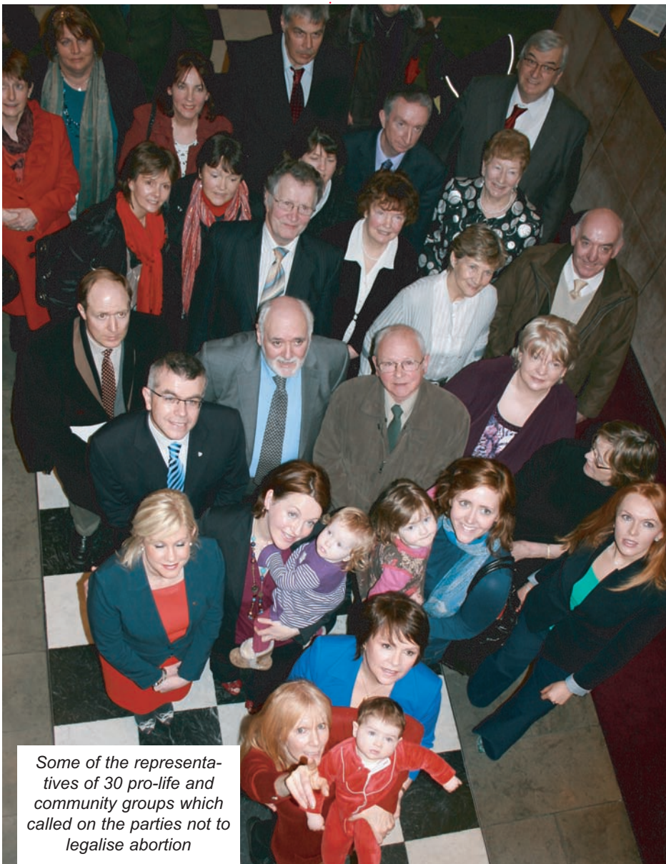
Some of the representatives of 30 pro-life and community groups which called on the parties not to legalise abortion