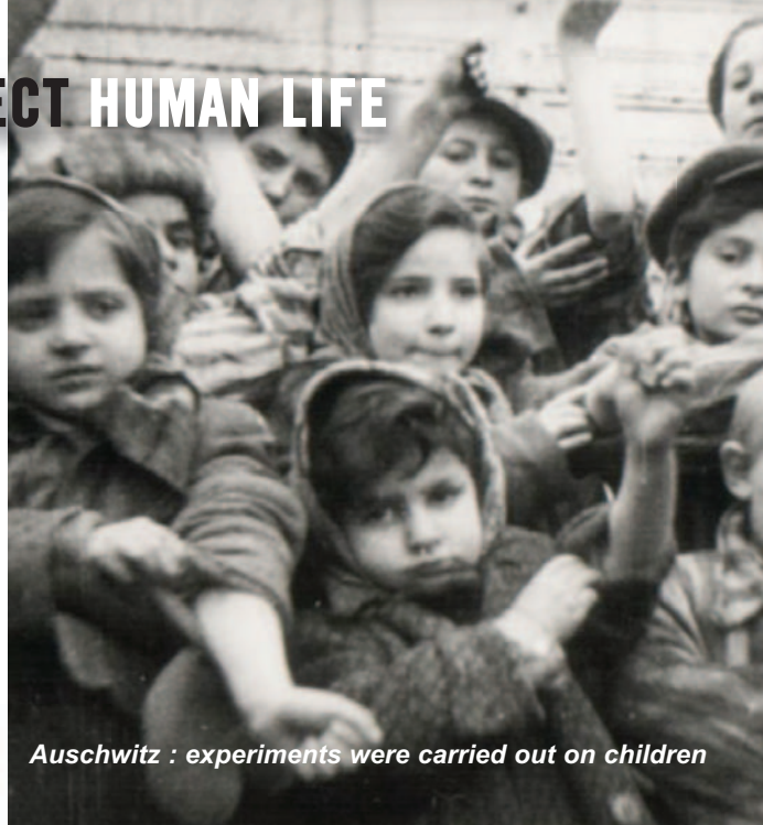
Auschwitz : experiments were carried out on children