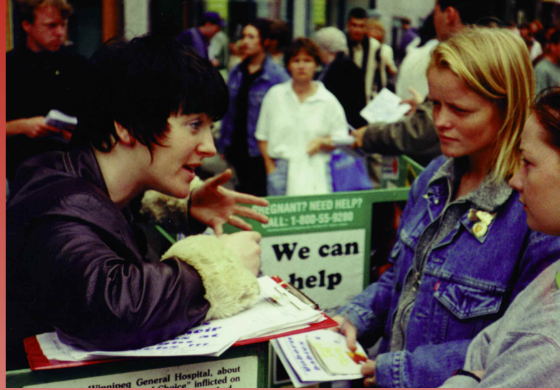
Answering questions during our weekly Street Information Sessions