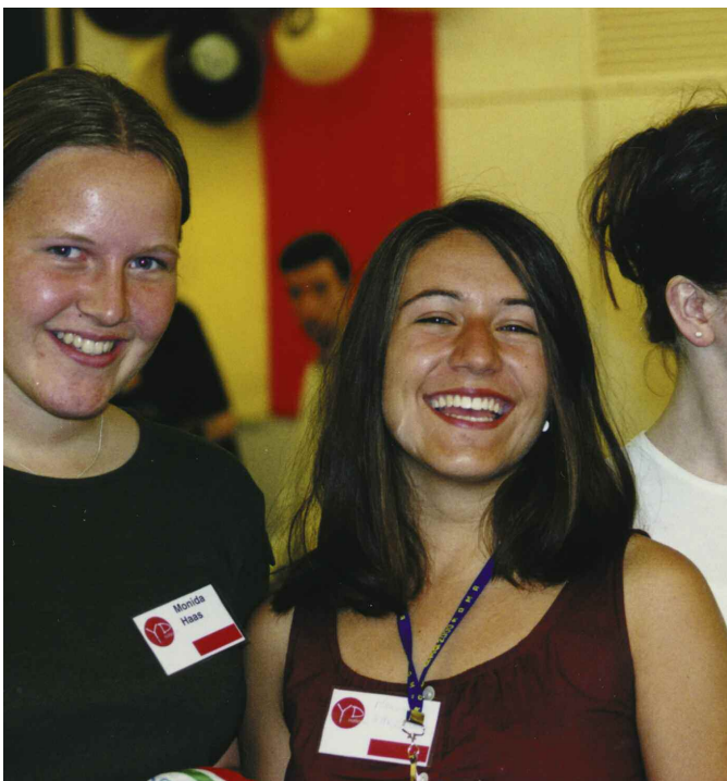
YD holds very successful International Pro-life Activists Conferences which attract visitors from around the globe. They are now considered a must-do on the pro-life calendar.