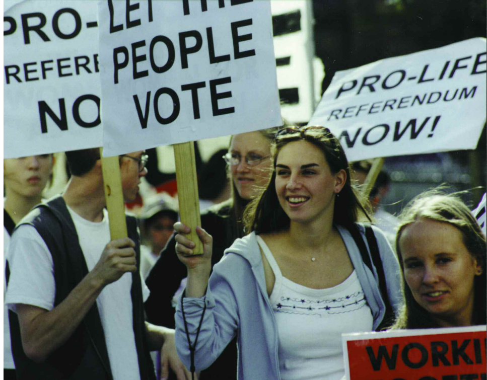
Making a stand for life. Youth Defence organise young people to work together against abortion. We work together to keep Ireland abortion free

It was time for young people to make their voices heard against abortion. Youth Defence is Ireland's largest and most successful pro-life organisation.