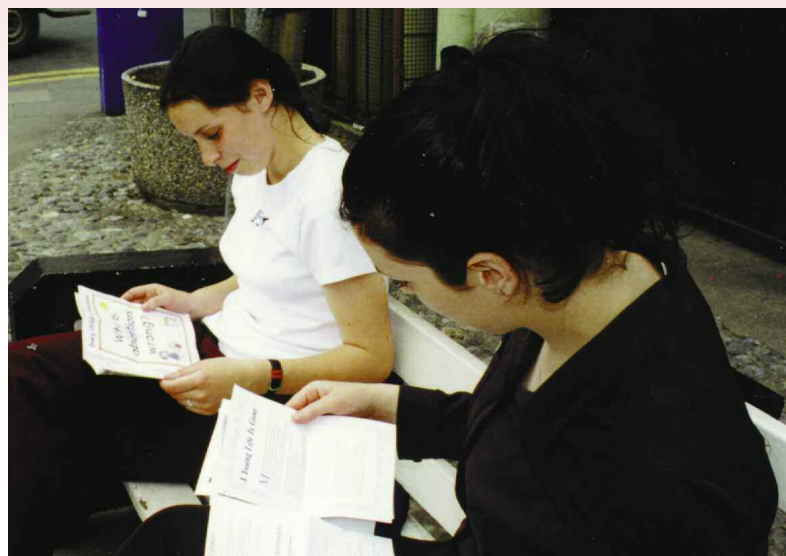
Reading YD pro-life literature received at one of our Annual National Information Roadshows

Youth Defence - the cutting edge of the pro-life movement