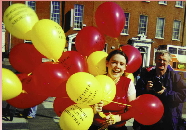
A demonstration during the 2nd International Pro-life Activists Conference organised by YD